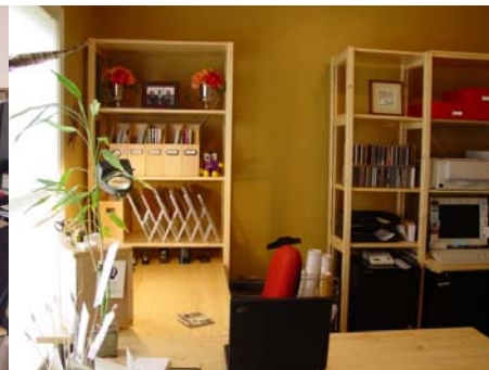
HGTV Home Office Project