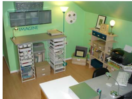
HGTV Suburban Craft Room Project (north wall)