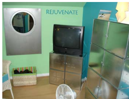
HGTV Suburban Craft Room Project (south wall)