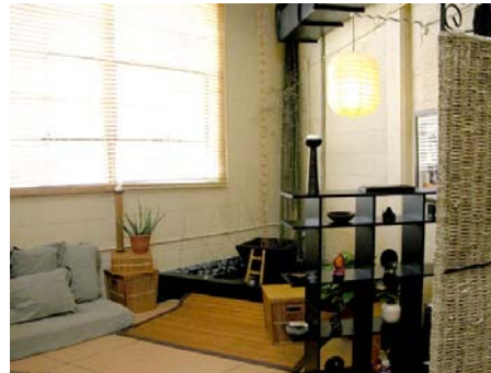
HGTV Downtown Loft Project